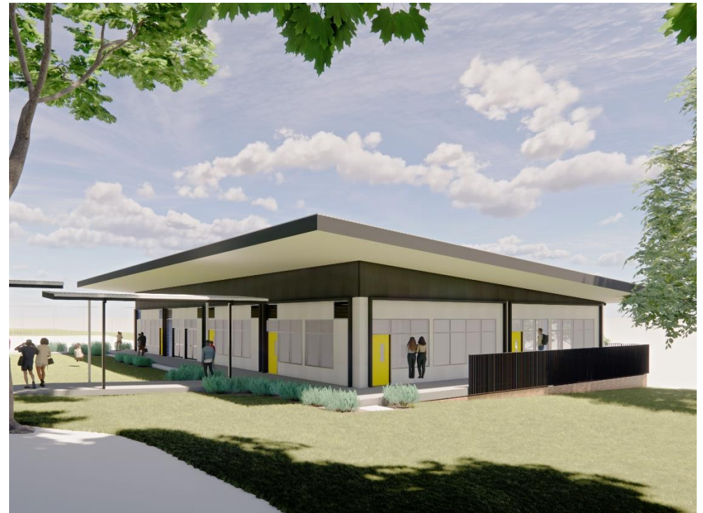
Figure 7: Artists Impression – View from North-East Corner