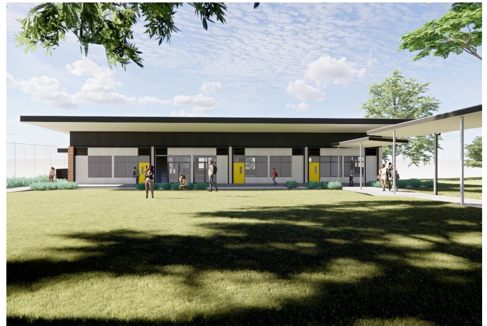
Figure 3: Artists Impression – View from North-East Corner