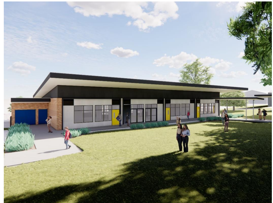
Figure 6: Artists Impression – View from South-East Corner

Attached to this report are artist impression perspectives that indicate a realistic representation of the propose building in the proposed setting on the site