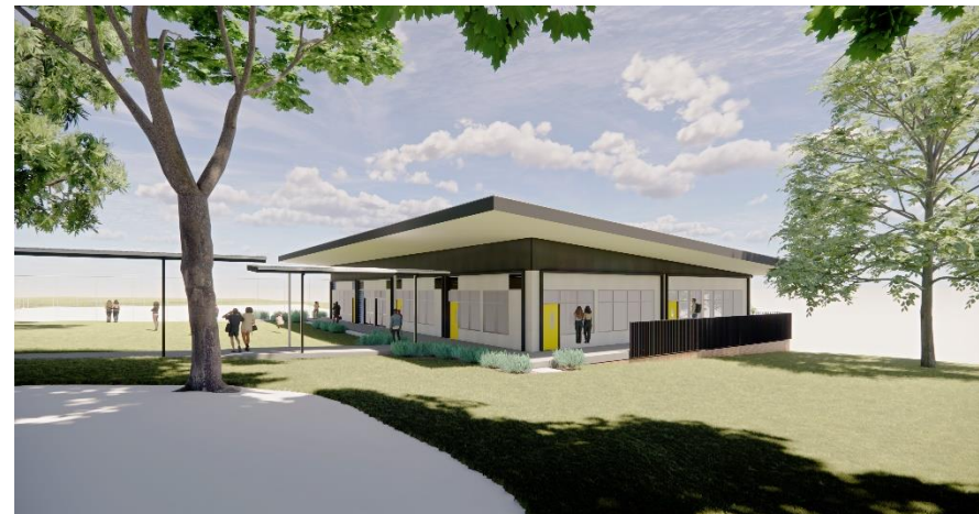
Figure 5: Artists Impression – View from North-East (Source: Fulton Trotter Architects)