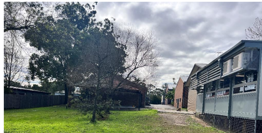
Figure 4: Existing Trees to the Western Boundary